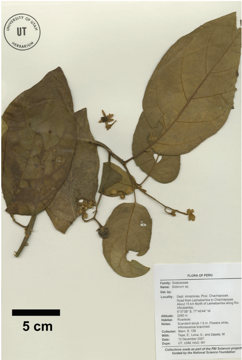
Figure 3. Isotype of Solanum achorum S. Stern [Stern et al. 129 (UT)].