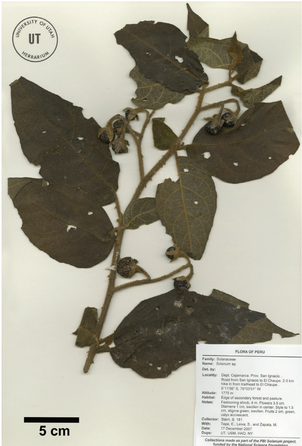
Figure 1. Isotype of Solanum rubicaule S. Stern [Stern et al. 181 (UT)].