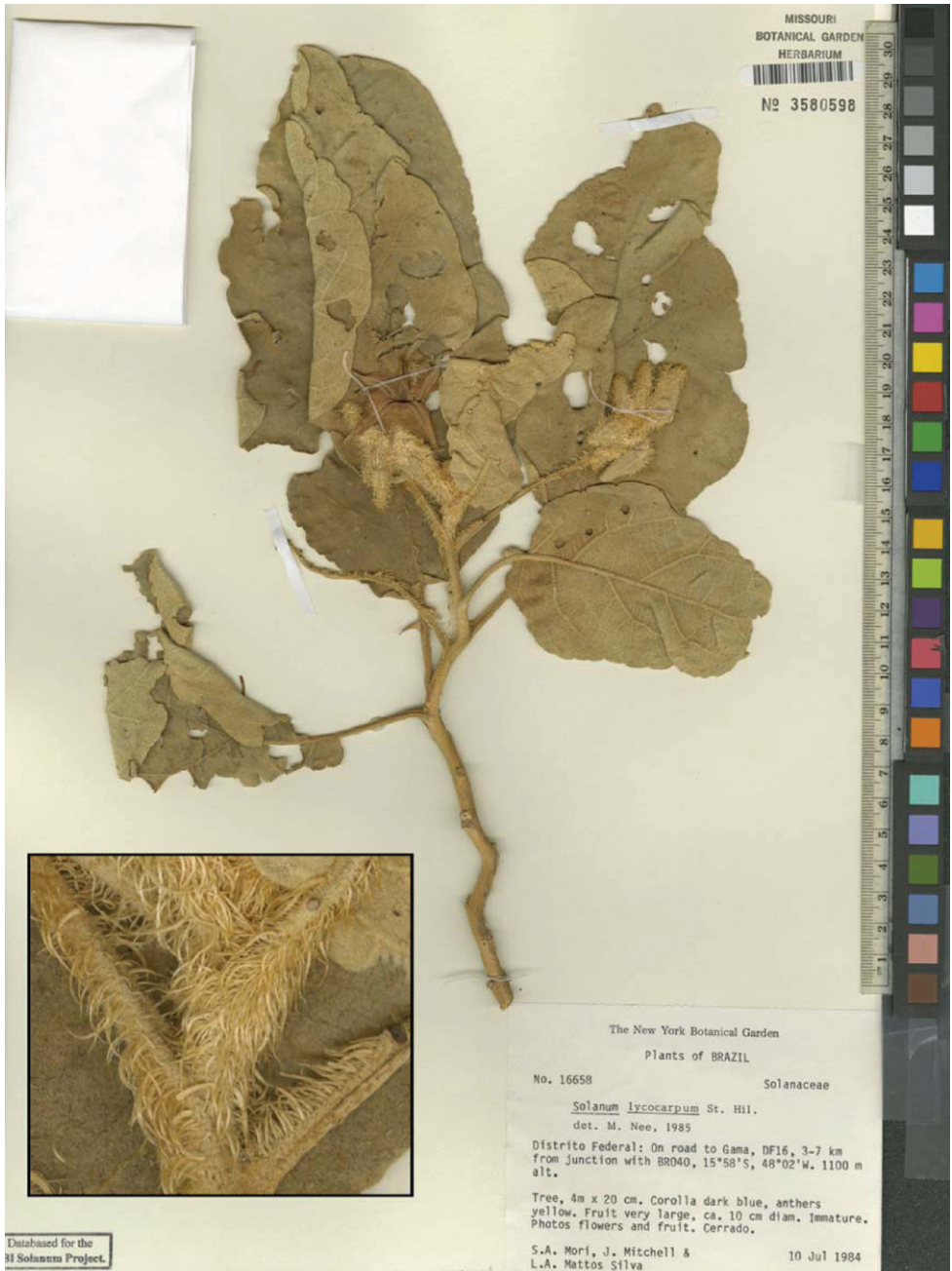
Figure 1. Solanum falciforme Farruggia. Image of Isotype [S.A. Mori et al. 16658 (MO)]. Detail of falcate hairs (inset).