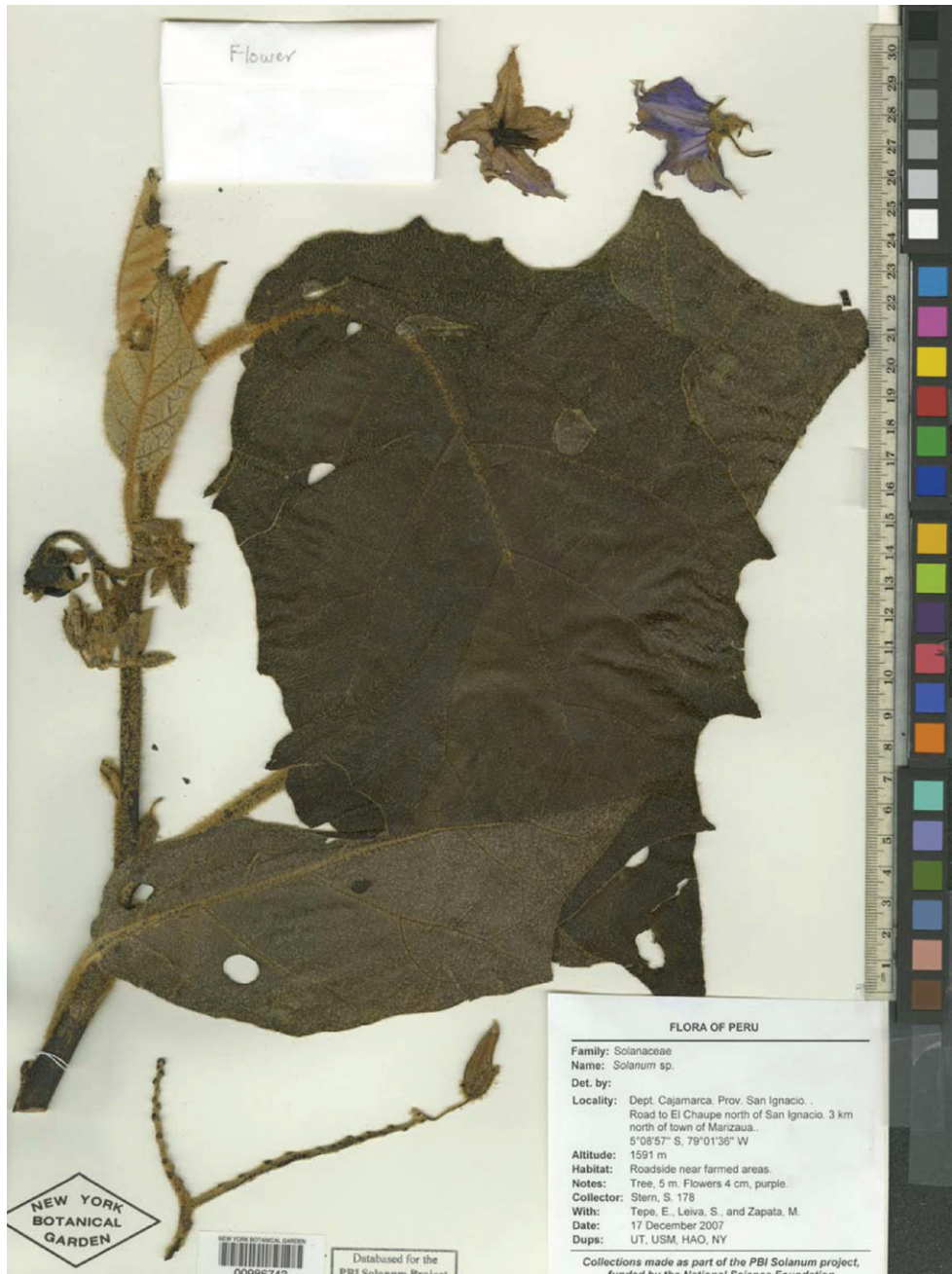
Figure 3. Solanum pseudosycophanta Farruggia. Image of isotype [S. Stern et al. 178 (NY)].